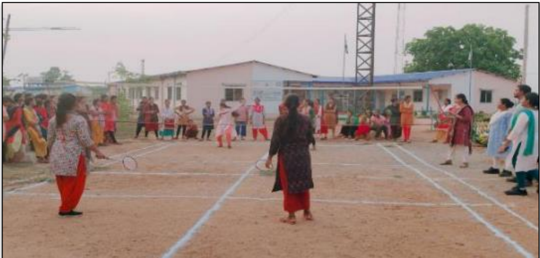
Playground facilities and Sports Day Program