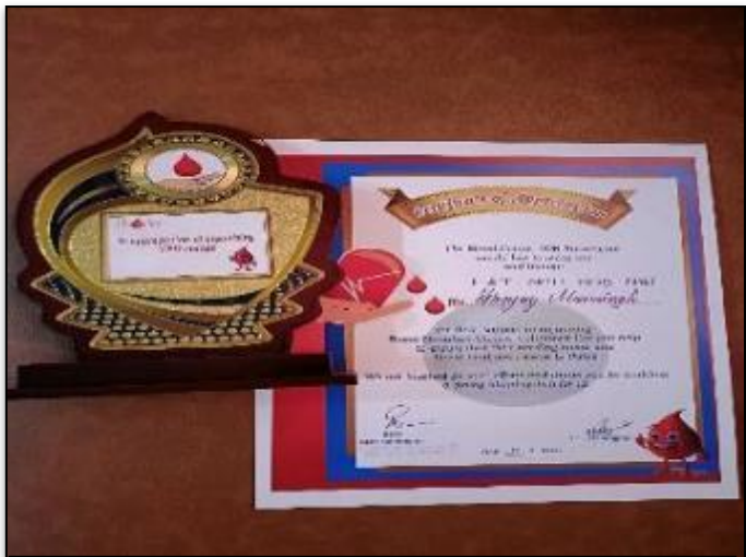
Appreciation certificate for best Blood donor from SDH-Govt of Odisha