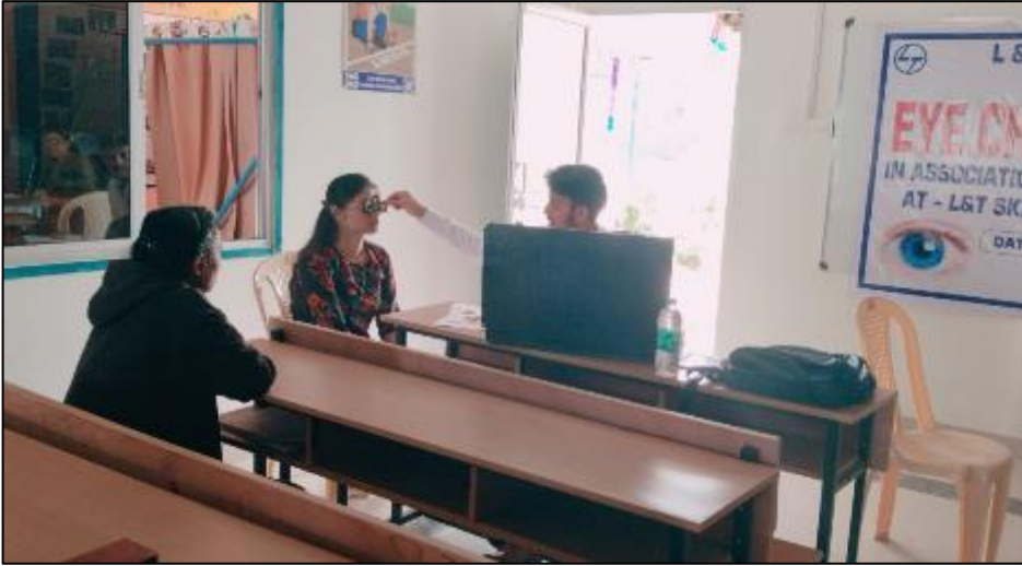
L&T Skill Hub-Mayurbhanj organised Eye Check-up Camp on February 16, 2024