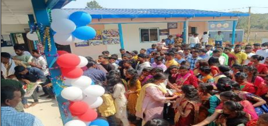
Saraswathi Puja Celebration on February 14, 2024