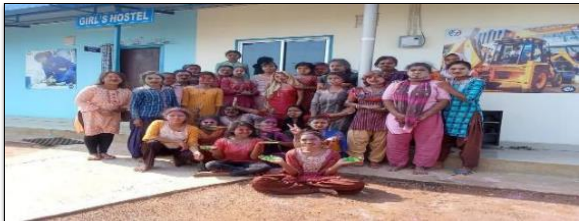
Holi Festival Celebration