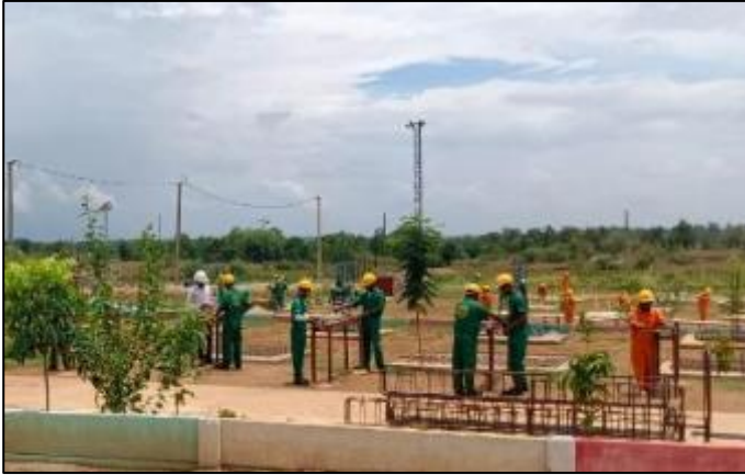
Bar Bending Trade