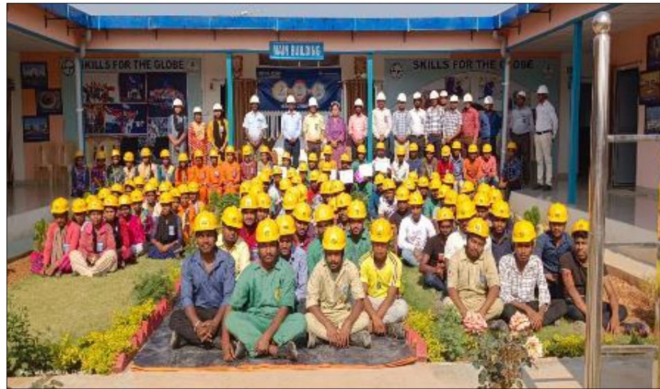
Felicitation of the Winners on Safety Day Celebrations